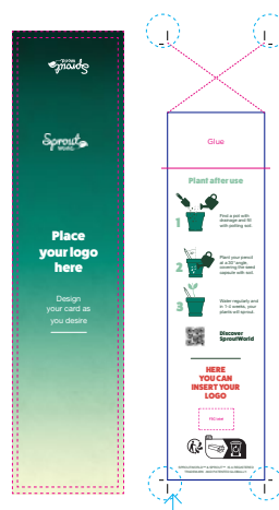
The template has the dieline on a separate layer, which can be made visible. This allows you to see where the card is cut.