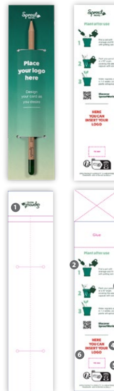
A visualization of a custom design example.