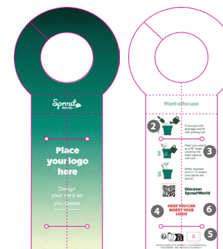
The template you can work from has the dieline on a separate layer.