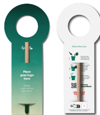
A visualization of a custom design example.